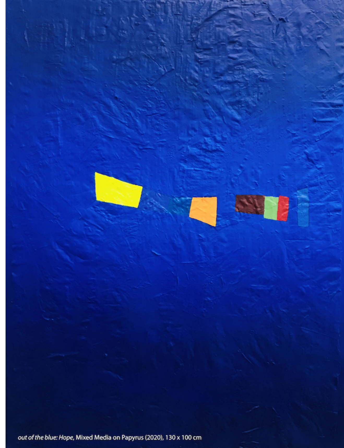
out of the blue: Hope, Mixed Media on Paper (2020), 130 x 100 cm

Roles of an artist can be varied. Depending on creations they can take a receptive audience on a journey in TIME. They can create awareness, provoke thought, build bridges and cross borders with an artistic licence.