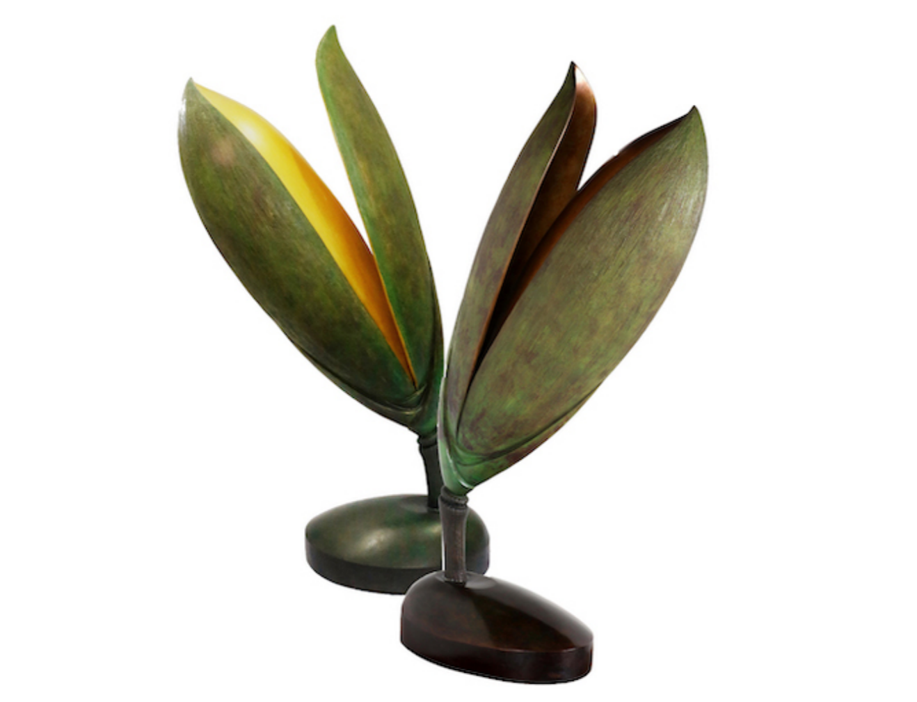
Big Foot #1 and #2, Bronze (2010), 136 x 70 32 cm and 140 x 50 x 32 cm

I have been based in Singapore for the last 31 years. Recollection is not an easy one. Deep interest and connecting 'dots' were probably the first steps. In time the dots changed to punctuation marks and I created works in various mediums visually and coined them into a series. I see my works as [a] continuum. It builds and layers over time.