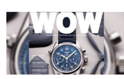
— On Newsstand: WOW Festive 2020