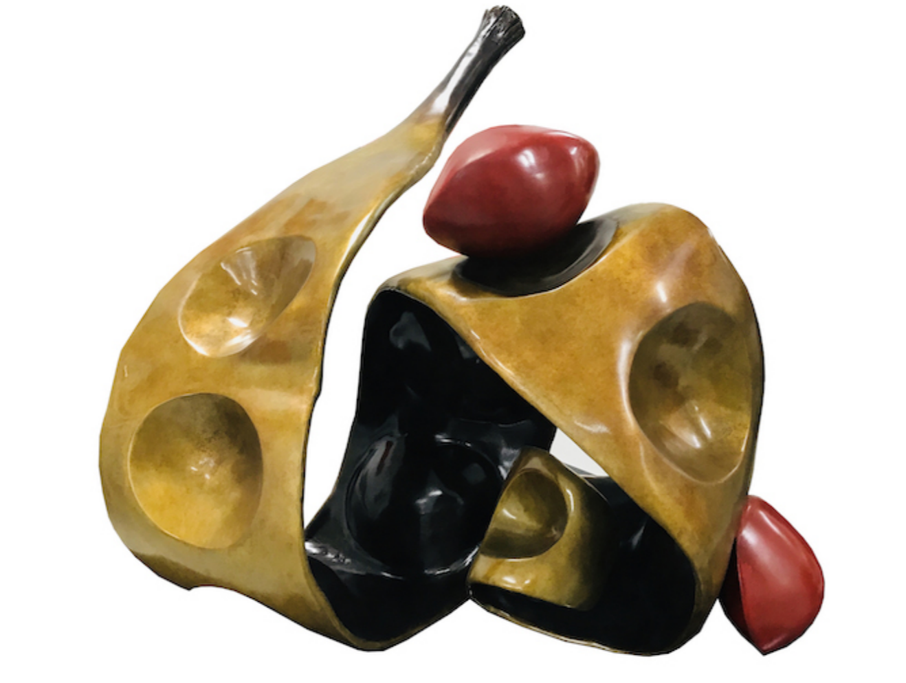
Ink-Bit Bones (2010), 65 x 55 x 65 cm

Depending on the subject matter the creative process changes. I am a firm believer in first hand information, hence my research takes me to basics. Exploring, experimentation, gardening, reading, photography, travel are all part of the process. The methodology is woven like a spider's web incorporating multiple processes to reach the 'goal'. (This is when the heart, the head and the hand come together.)