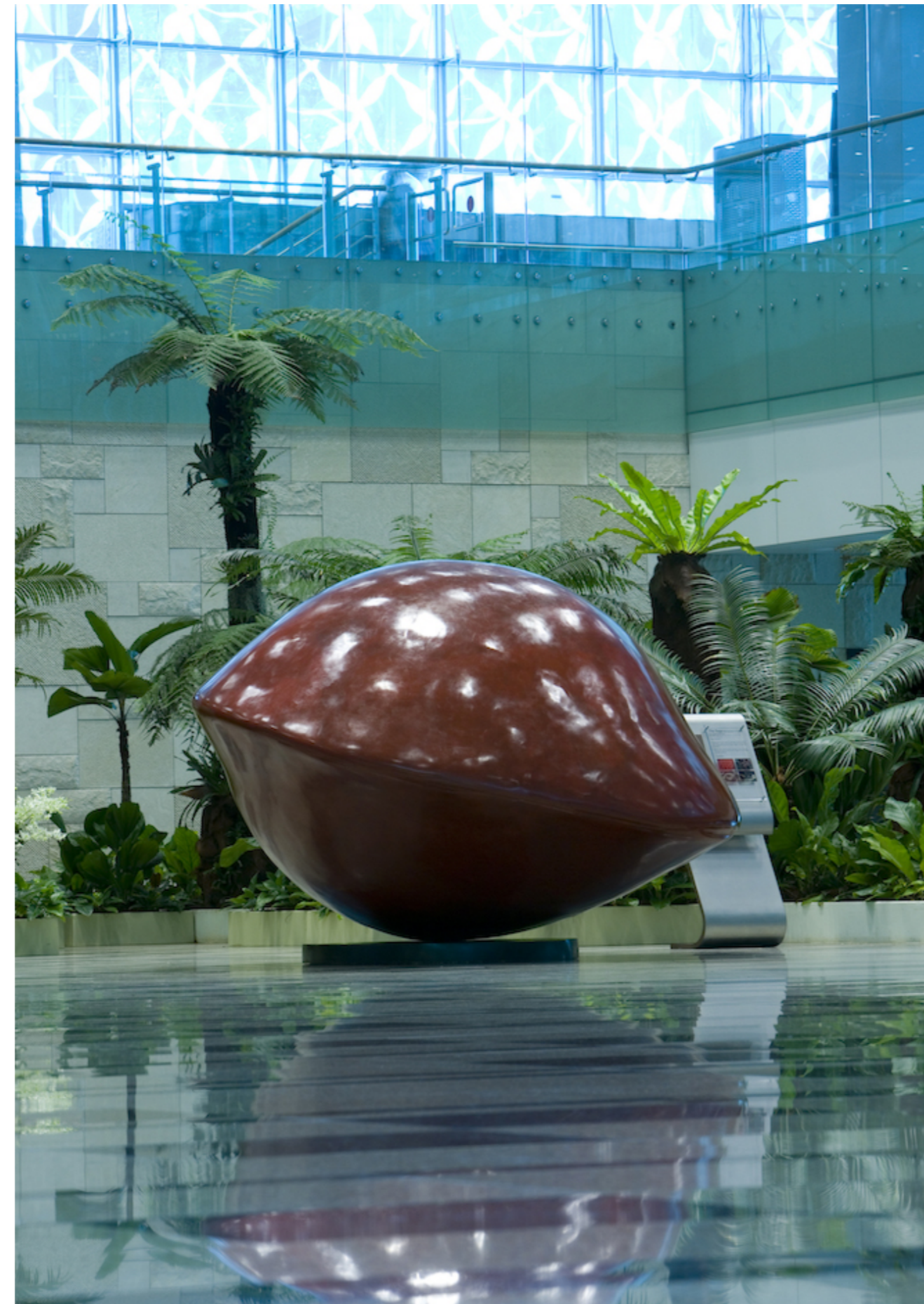
Saga, Bronze (2007), Terminal 3 Changi Airport, Singapore